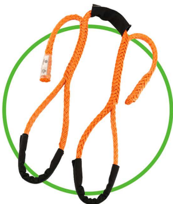
Double Adjustable Transformer Sling