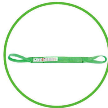
Heavy Duty Eye & Eye Web Slings