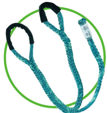
Storm Surge Sling